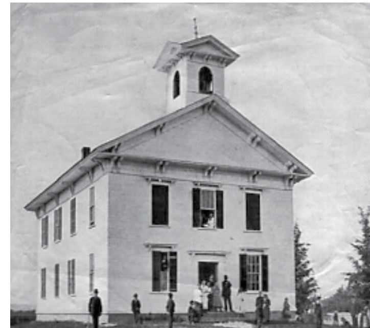
Contoocook Academy, ca 1856

This course meets the ICT “additional course” requirement.